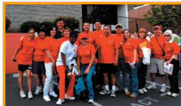
Union Bank of California