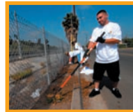
Akins Avenue Clean-Up