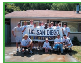
UCSD Water Polo Team at the Maxwell Home