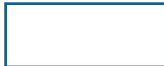
Mural designed by Leonard Gonzales