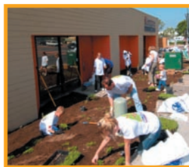
Shell Trading doing landscaping - Tubman Chavez Center