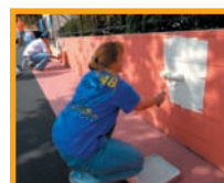
Painting at Second Chance